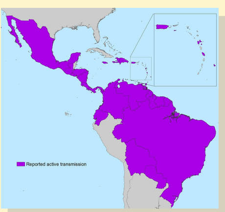
Countries in the Americas with local transmission of Zika.

SB 75 is new legislation that extends full-scope Medi-Cal benefits to all children under the age of 19, regardless of immigration status, provided they fulfill the income eligibility requirement. The projected system implementation date is May 16, 2016 when children and youth currently enrolled in restrictive Medi-Cal will be automatically transitioned into full-scope, fee-for-service (FFS) Medi-Cal. A notice will be automatically generated and sent to current enrollees informing them of the increase in benefits. Additional notification letters have been developed outlining their health insurance coverage options moving forward including information on the locally available managed care plans. Those who turn 19 within six months of the transition date will be enrolled in FFS full-scope Medi-Cal and will not be required to enroll in a managed care plan, but still may choose to do so. New enrollees, those under 19 and who currently have no Medi-Cal coverage, will be sent managed care information after applying and being determined eligible for full-scope Medi-Cal. The Department of Health Care Services (DHCS) will post a provider bulletin prior to the transition date on the Medi-Cal Provider website. More information on SB 75 can be found at: http://www.dhcs.ca.gov/services/medi-cal/eligibility/Pages/sb-75.aspx