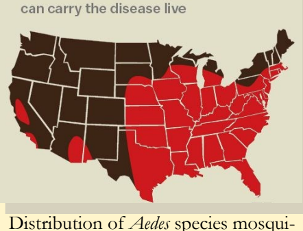
Distribution of Aedes species mosquitoes in the U.S.